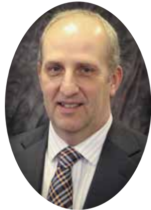
MESSAGE FROM THE PRESIDENT