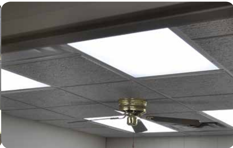
The new, energy efficient lighting (right) provides a much "whiter" light (measured in degrees Kelvin) than the traditional lighting (left). The co-op's switch will provide a payback of under 18 months, and will result in $4,956 savings on lighting costs annually.