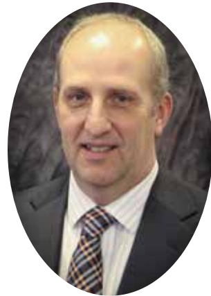
MESSAGE FROM THE PRESIDENT