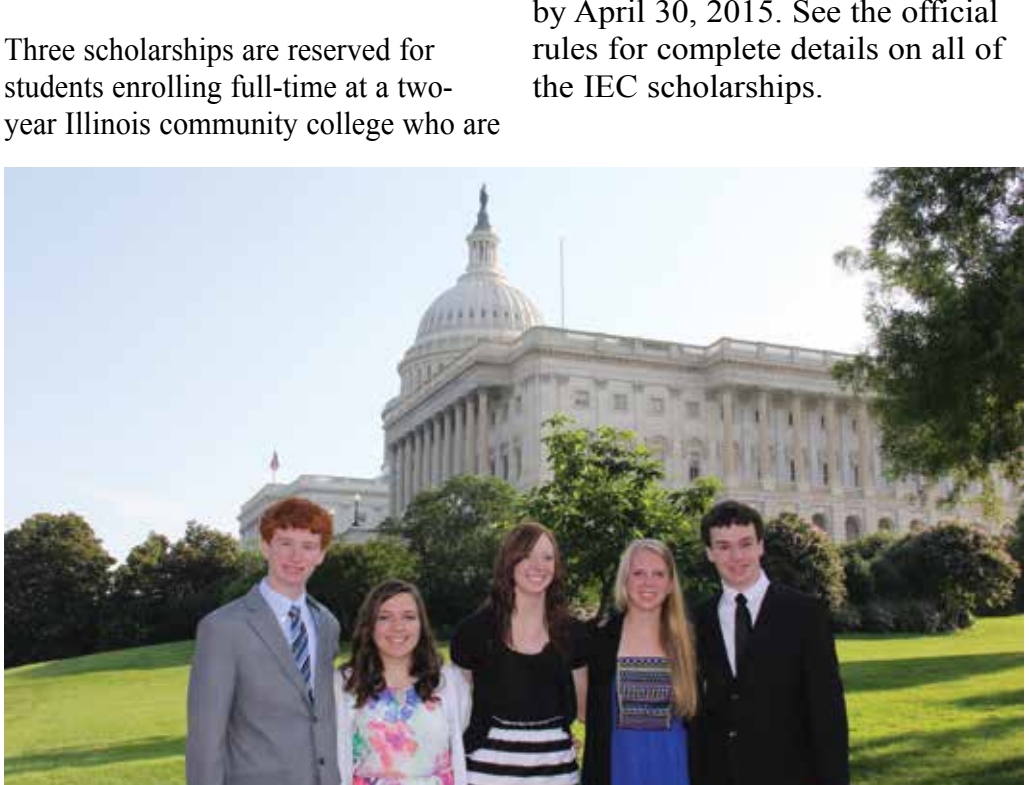
Eastern Illini's 2013/2014 scholarship winners visit the United States Capitol during the Youth to Washington tour. Applications for the 2014/2015 contest are available at www.eiec.coop.

Students who are children of an Illinois electric cooperative member/owner, or are related to an employee or director at an Illinois electric co-op are eligible, as are individuals who have served or are serving in the armed forces or National Guard. Applications for this scholarship must be postmarked by April 30, 2015. See the official rules for complete details on all of the IEC scholarships.