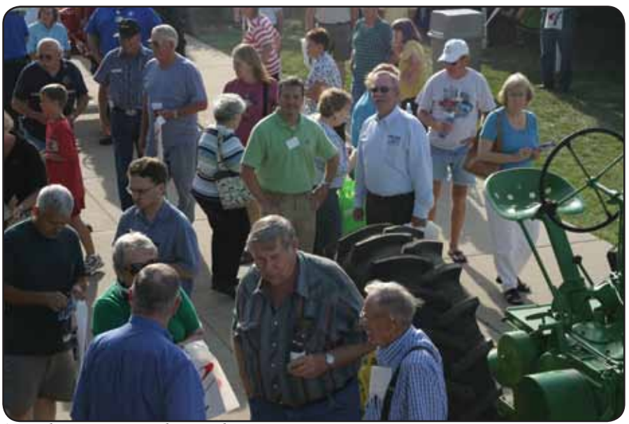
Annual meeting attendees gather outside. Antique tractors, kid's activities and a live band entertained the outside crowd during the meeting.

A young boy operates an antique corn sheller. This tool was just one of many antiques on display to help celebrate the co-op's 75th year of service.