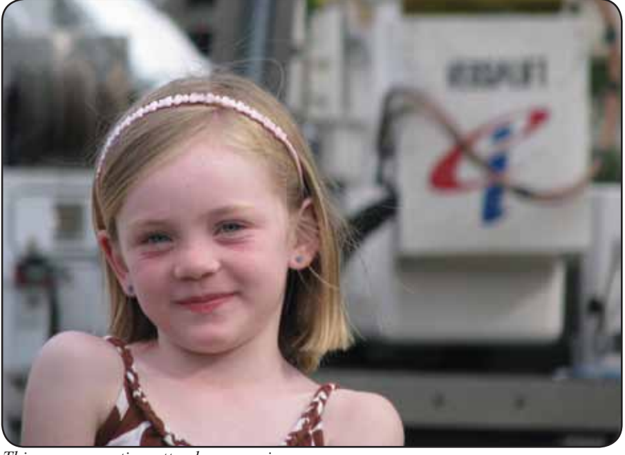
This young meeting attendee poses in front of an Eastern Illini bucket truck. Inflatable games and a miniature golf course entertained many youngsters.

Easten Illini member/owners relax after eating their meal. Niemerg's Catering catered the event, and over 2,000 meals were served during the meeting.