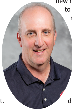
MESSAGE FROM THE PRESIDENT

On behalf of our employees and directors, know that we are dedicated to continuing to provide excellent service and we wish you the best during 2023.