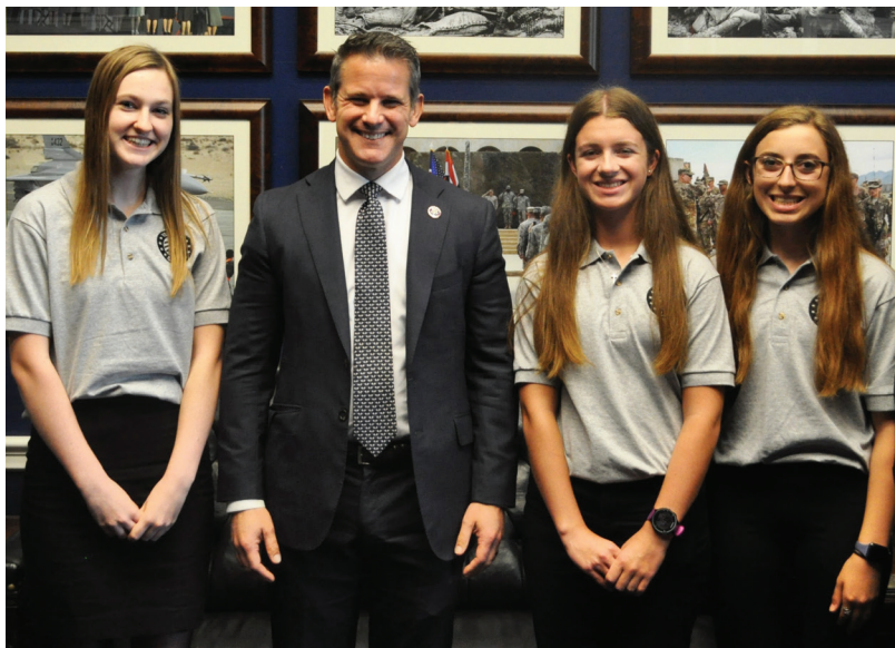
2022 Youth to Washington D.C. trip participants

Visit https://www.eiec.org/youth-washington-program to get more details and apply. Applications can be submitted on-line and the deadline for applying is February 13, 2023.