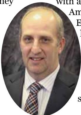
MESSAGE FROM THE PRESIDENT

America’s electric cooperatives. EIEC helped to sponsor five local students. The group got a first-hand lesson in crisis management in government as they were there when the Congressional ball field shooting occurred.