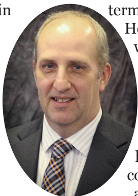
MESSAGE FROM THE PRESIDENT

Here at Eastern Illini, we welcome your questions and comments!