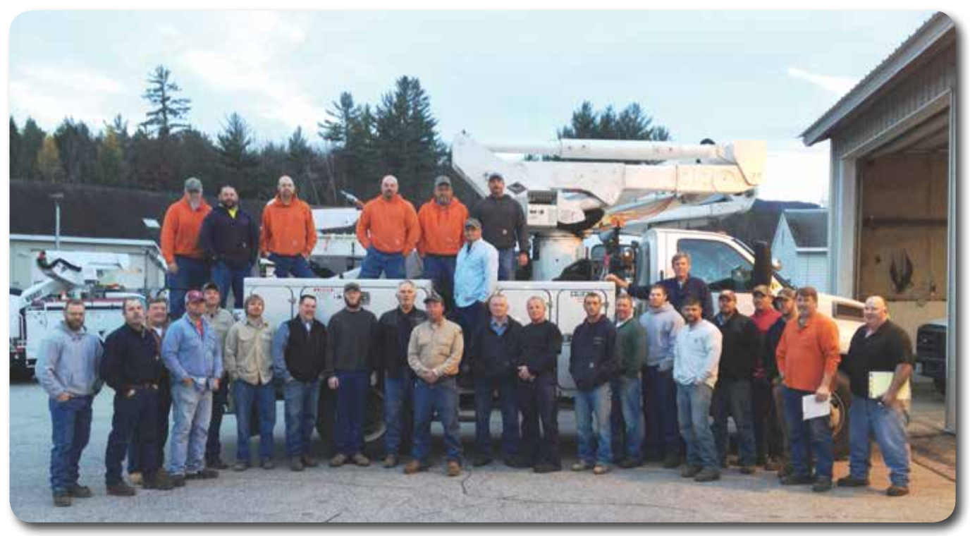
Employees from 11 Illinois electric cooperatives journeyed to New Hampshire to help restore power after Hurricane Sandy devastated the area. While co-ops like Eastern Illini regularly help other co-ops when needed, this was as far east as we've ever sent help.