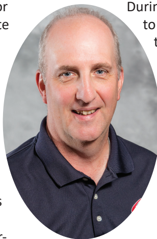
MESSAGE FROM THE PRESIDENT

member satisfaction benchmark. In addition, member ratings of employees ranked very high in all categories. Thank you! There are also areas identified in which we can improve. Your cooperative uses this member feedback to find ways to improve service and create a positive experience for members.